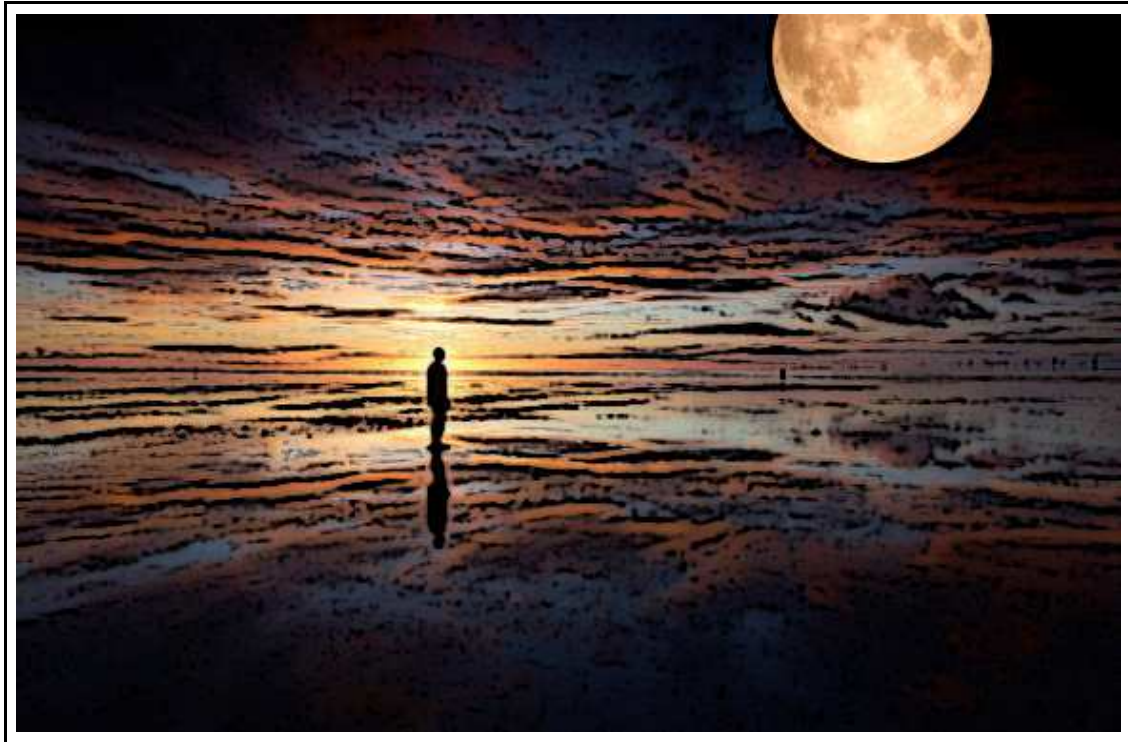
Solitude [Collage]. Doug Van Houten©, used by permission

September 13-15, 2019, Rolling Ridge Study Retreat